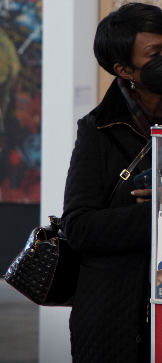
Visitors explore In These Truths (February 19–June 5, 2022) at Albright-Knox Northland.