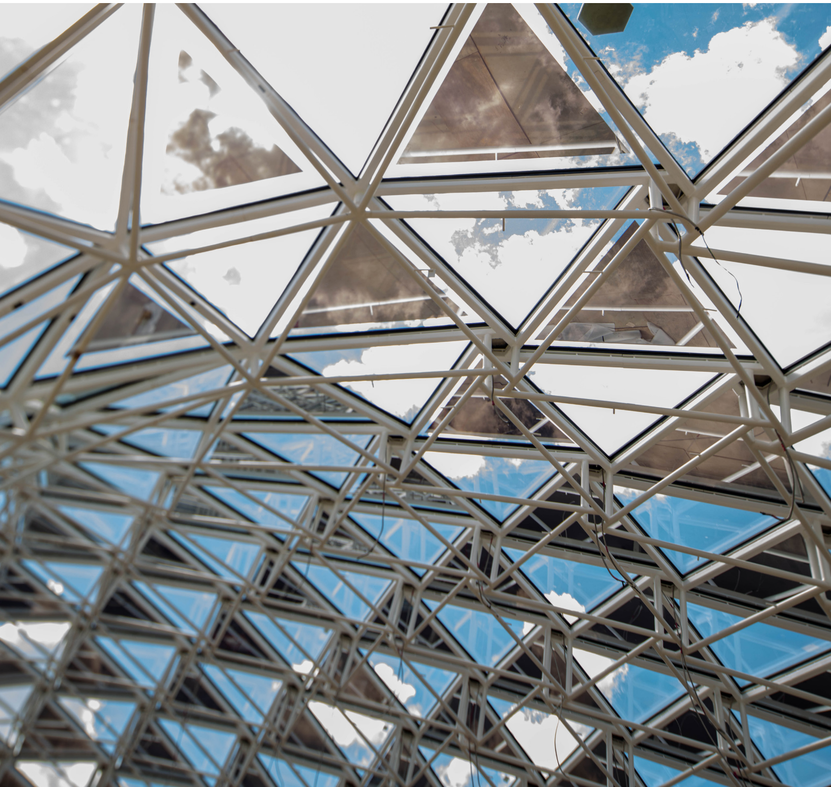
Common Sky, 2019, by Olafur Eliasson and Sebastian Behmann of Studio Other Spaces, will cover the museum's new indoor Town Square in the Seymour H. Knox Building.

The Board of Directors extends deep gratitude to each of the generous donors who have made gifts and pledges to the campaign. Gifts of $1,000 or more are listed here.