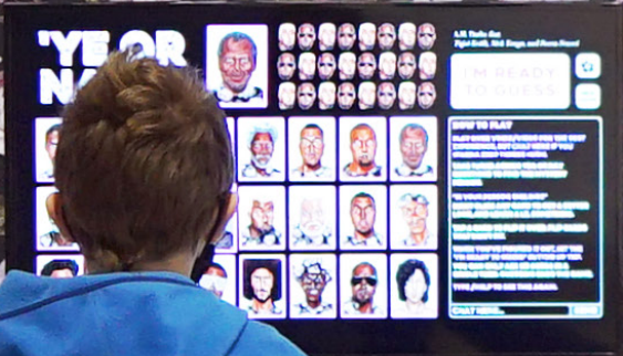
Visitors play A.M. Darke's 'Ye or Nay?', 2020, in Difference Machines: Technology and Identity in Contemporary Art (October 16, 2021–January 16, 2022) at Albright-Knox Northland.