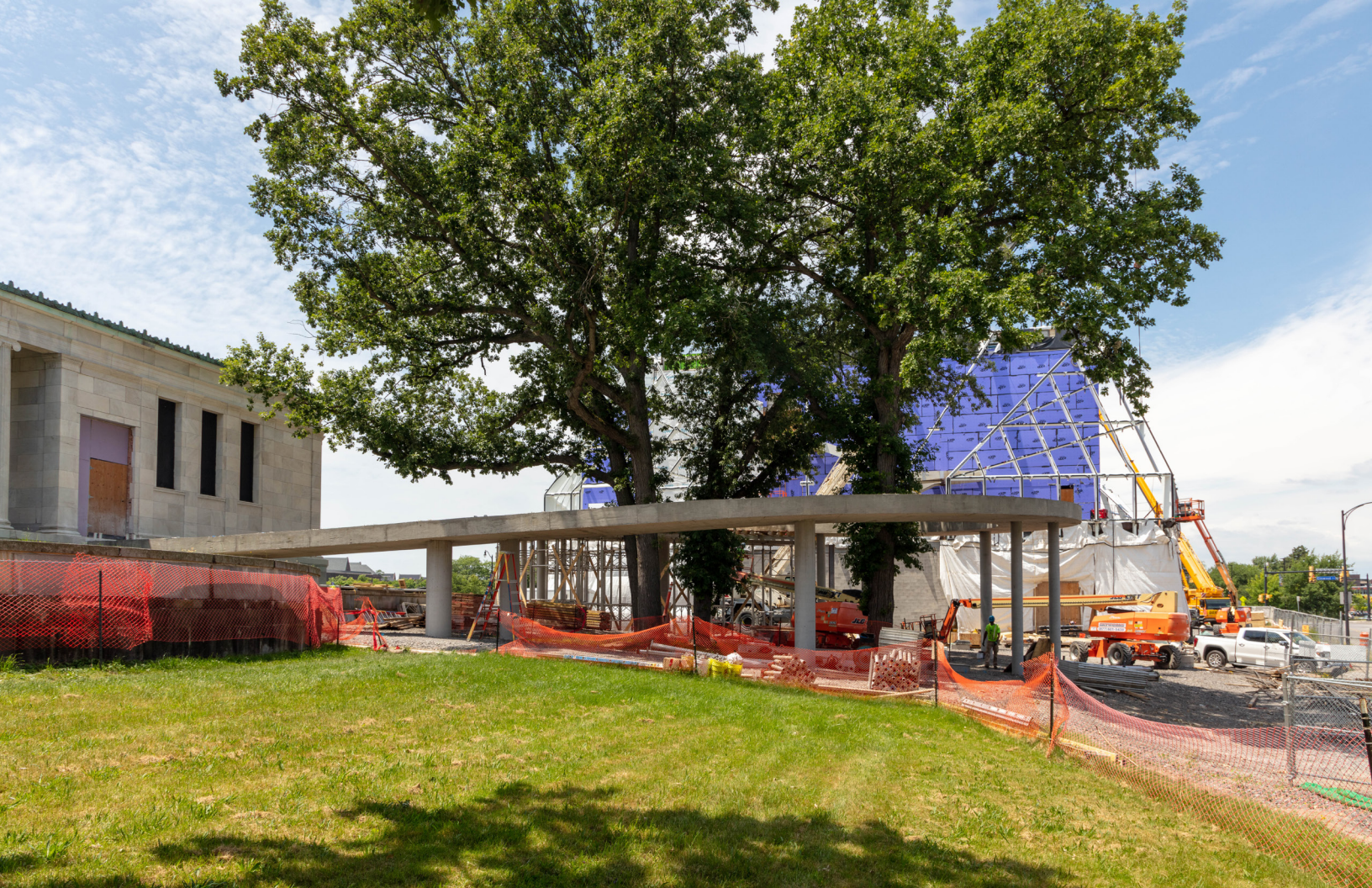
The foundation of the John J. Albright Bridge.