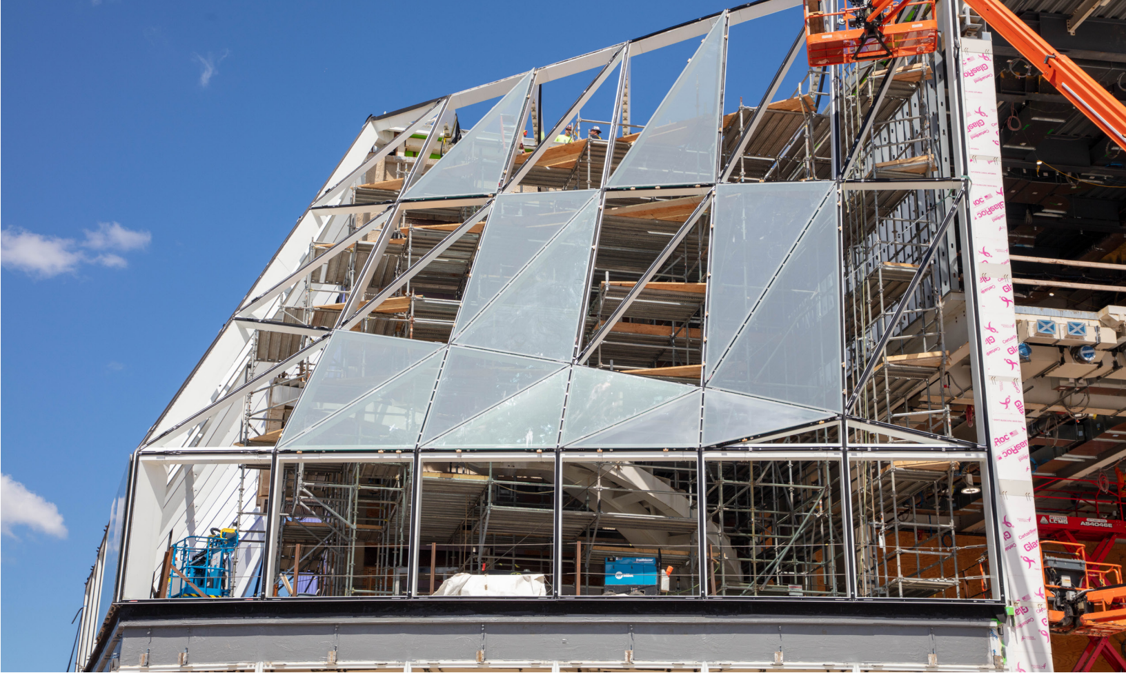
Installation of glass panels on the façade of the Jeffrey E. Gundlach Building.