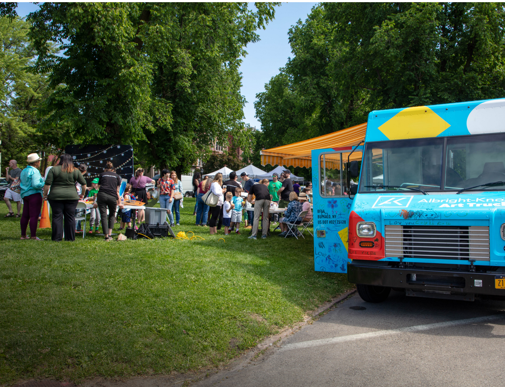
Buffalo AKG staff led art activities with the Art Truck at Art Alive 2022 on June 11, 2022, at Bidwell Parkway.